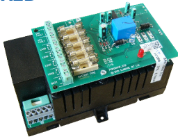
DIN RAIL Mountable - (Battery leads included)