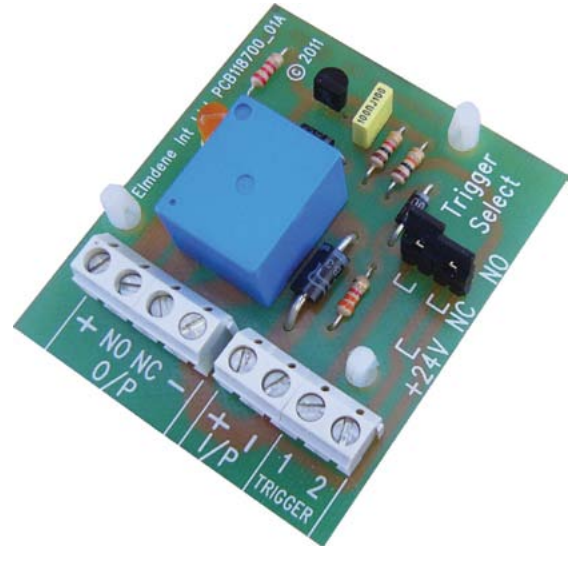
PSU Interface: PSUIR-12/24